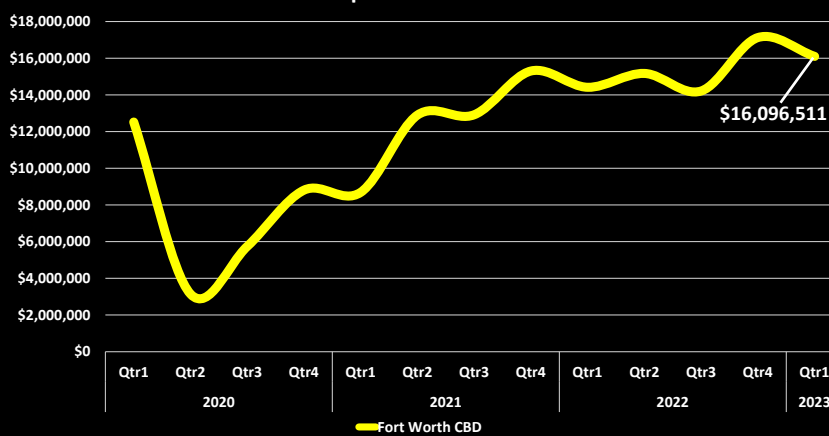
TABC Total Receipts for Downtown Fort Worth