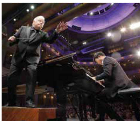
Piano icon Van Cliburn International Piano Competition