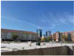
AVID HOTEL Hotel, 104 rooms