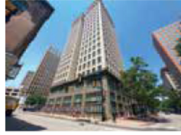
SANDMAN SIGNATURE HOTEL Hotel, 245 rooms (Existing building conversion)