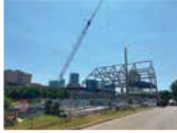
PARADOX CHURCH New Construction