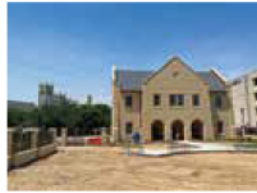
FIRST UNITED METHODIST CHURCH Church expansion