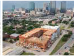
THE HUNTLEY Residential, 296 units, 51% affordable units in partnership with Fort Worth Housing Solutions