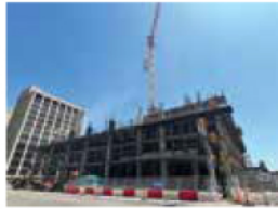
DECO 969 Residential, 27 stories, 302 units