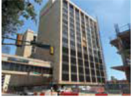
LE MERIDIAN Hotel, 189 rooms (Existing building conversion)