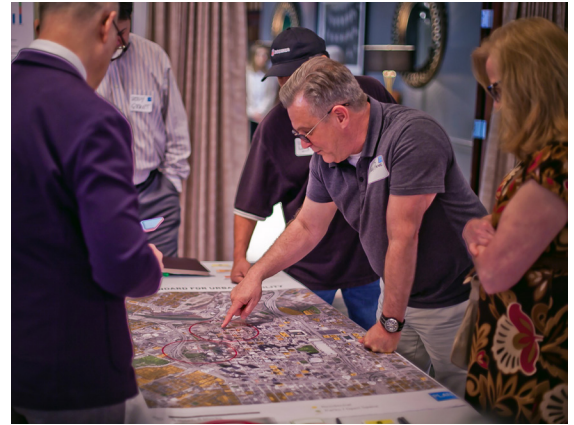
Plan Downtown Public Workshop