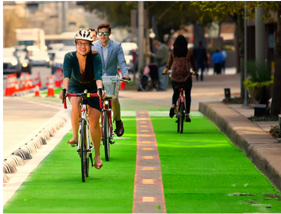
Lamar Cycle Track