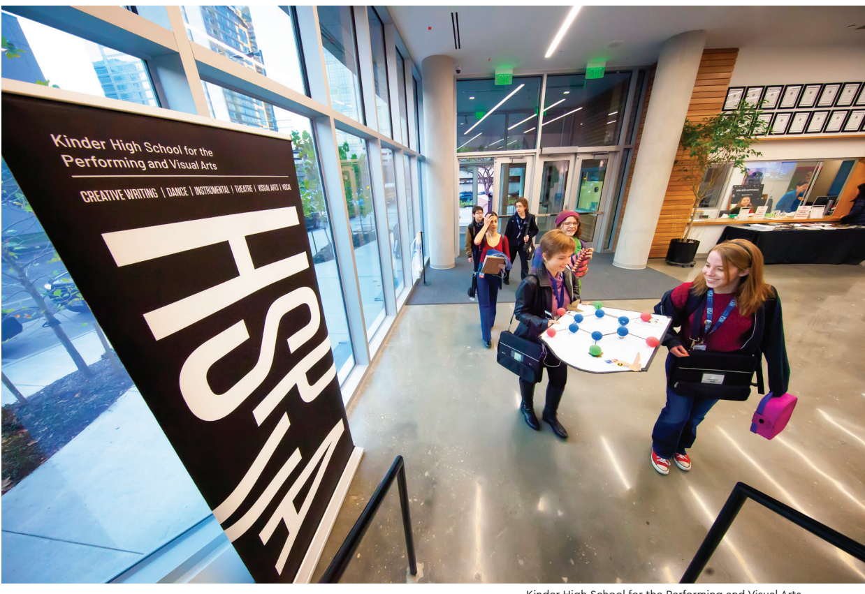
Kinder High School for the Performing and Visual Arts