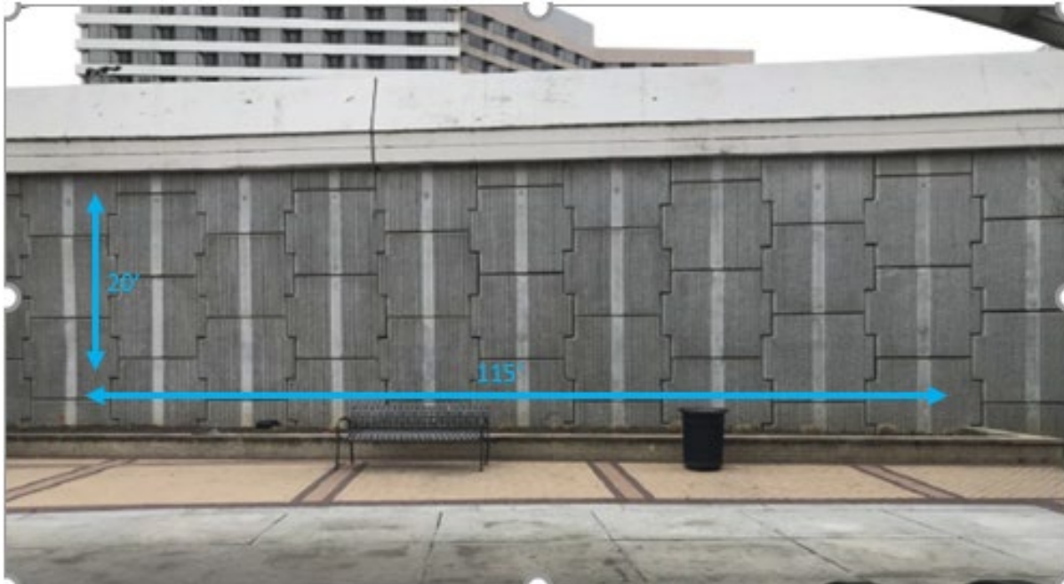
Figure 3. Mural Wall Dimension- Crystal City Metro Station Wall. The mural dimensions shown here are approximate.

The proposed location of the mural is the metro station's west wall, facing the entrance. The wall is approximately 115 feet in length and 20 feet high. While the current concrete wall composite has a textured patterned front, the BID encourages artists to offer a creative approach to produce a mural or installation. Artists should consider beautifying the wall either through panel installations or by directly painting onto the wall.