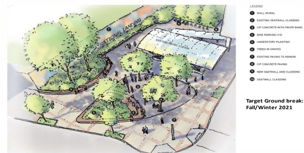
Figure 1. Proposed Crystal City Metro Plaza Improvements. The re-envisioned Metro Plaza improvements will offer new seating treatments, improved lighting, and new landscaping to the existing plaza.

this fall, following implementation of the proposed plaza improvements. The plaza improvements and mural project combined are set to establish a warm welcome for returning commuters and visitors.